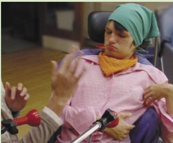
Creating more space for activities will give residents more opportunities to use sensory equipment like this sound beam technology.