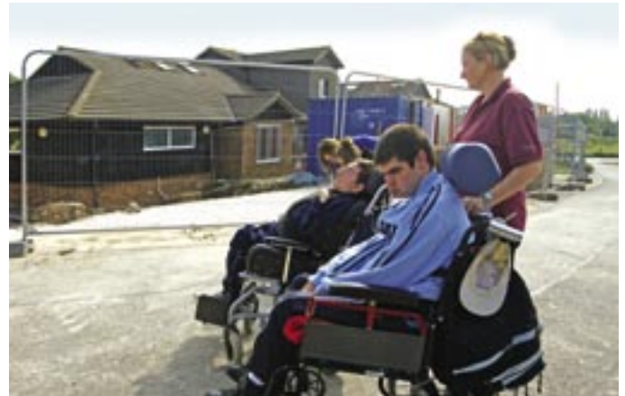
Residents and staff watch the building progress at Frances House

When work to extend Mary House in Hastings ends in June, we will have added seven new lifetime residential care places at Deal and Hastings, bringing the total number of people we look after to 33.