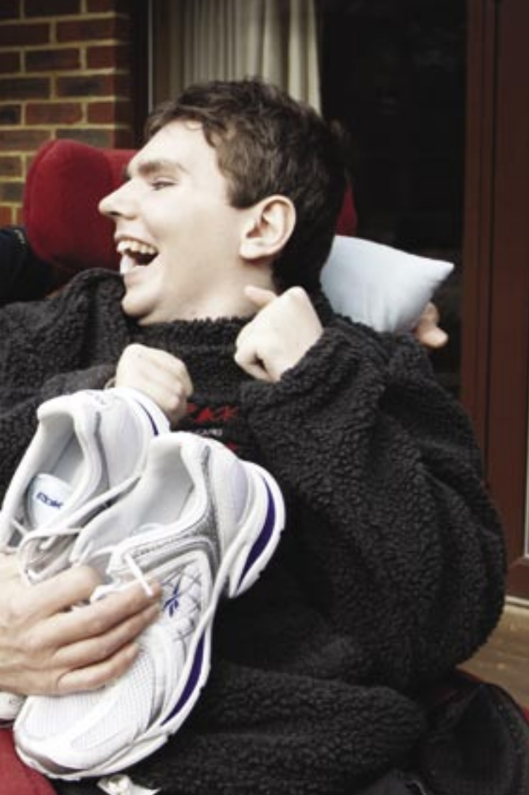
Jill's running trainers (read more on back page) to the dentist?