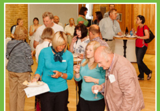
A tippie in Canterbury