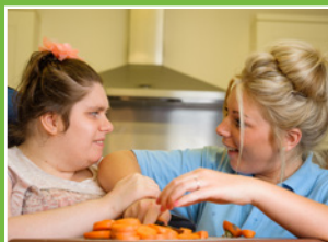
In the kitchen