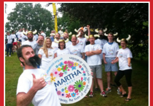
Fundraising can be fun!