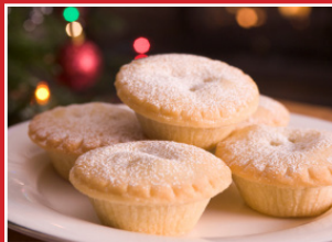
Christmas is coming . . .