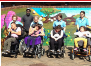
The courtyard blossoms