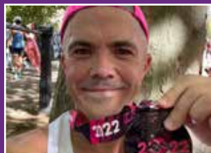
Thank you all!