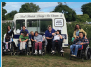
Fun on the Farm